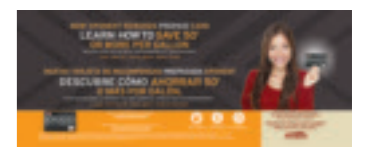
Pump Topper/Trash Valet Topper