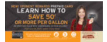
Pump Topper/Trash Valet Topper